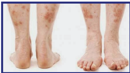
Although the exact cause of diabetic dermopathy is unknown, it is likely associated with vascular complications caused by diabetes mellitus.

Diabetes has a negative effect on skin integrity, which can significantly increase a patient's risk for bacterial infection. These infections can exacerbate already compromised skin causing itching, redness, dryness, and pain. 8