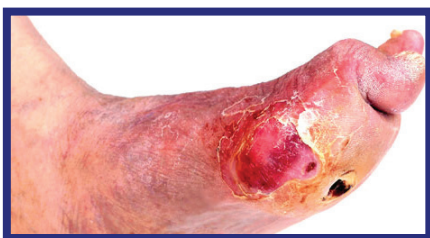
Diabetic foot ulcers are one of the most common causes of lower extremity amputation in the western world.

Up to 25% of all individuals with diabetes will develop a foot ulcer at some point in their life. This can cause many potentially life-threatening complications and even lead to amputation. Costing approximately $9 billion every year, this makes foot ulcers one of the most costly ramifications associated with diabetes. 12, 13, 23 These issues generally begin with neuropathy, and can progress to diabetic wounds, infection and in some cases even amputation or death. As nerve damage leads to loss of feeling in the extremities, patients are much less likely to notice uncomfortable pressure or injury. Over time, this can lead to excessive skin breakdown such as blisters and eventual ulcers. Xerosis and other issues associated