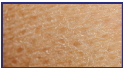
Xerosis affects as much as 82% of the population with diabetes.

Diabetes can negatively impact circulation, particularly in the extremities. 8 This can, in some cases, lead to itching, dryness (xerosis) and cracking. The condition has been found to affect as much as 82% of the population with diabetes. 22 High glucose levels are correlated with dry skin, which can also cause itching, discomfort, and increased risk of bacterial infection. Damage to circulation can divert blood from the skin's surface, leading to excessively dry skin that is more prone to bacterial infection. 9 Diabetes can also cause dehydration, leading to excessive thirst, poorly hydrated skin, and dryness. 30