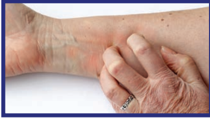
Pruritus is more than three times as common in individuals with diabetes as in the general population.

with diabetes can also weaken the skin, making it more prone to ulcer development. Approximately 56% of diabetic foot ulcerations become infected and 20% of those that get infected eventually require some form of amputation. 3, 29, 31